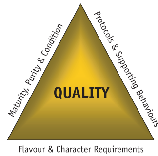
The Winegrape Quality Triangle

A useful model with which to consider grape quality is the Quality Triangle which, for the purposes of grape transactions, groups all the factors that can influence grape quality into three 'legs' of a triangle.